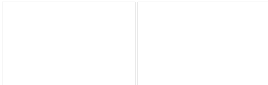
1929 Bentley 4 1/2 litre Supercharged 'Blower' Four Seater