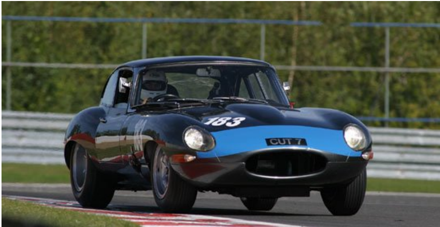
1961 Jaguar E-Type 3.8 FHC 'CUT 7'

H&H sold their featured lot, the 1953 Bentley 'R' Type Drophead Coupe for £123,625 at their recent Buxton sale. Looking ahead to 2005, a highlight of the International Historic Motorsport Show sale will be the ex-Dick Protheroe Jaguar.