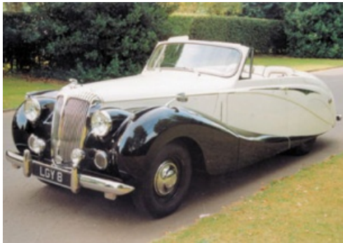
1950 DAIMLER DB18 SPECIAL COUPE

H&H Classic Auctions next sale to be held on 10th December will feature four vehicles with famous provenance. Ex-Royal Household 1950 Daimler DB18 and 1978 Range Rover, David Beckham's 1996 BMW M3 Evolution Convertible and the ex Mikkola/Hertz 1984/5 Audi Sport Quattro.