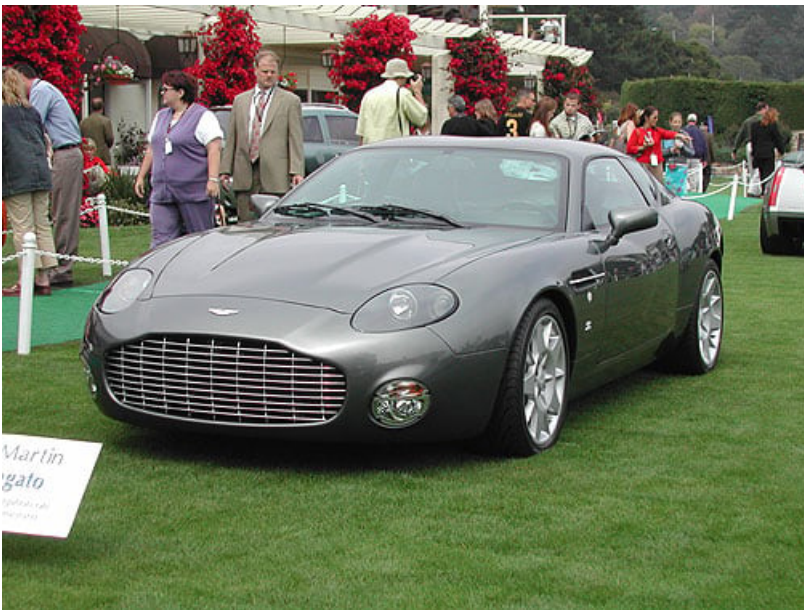
The DB7 Zagato at Pebble Beach 2002.