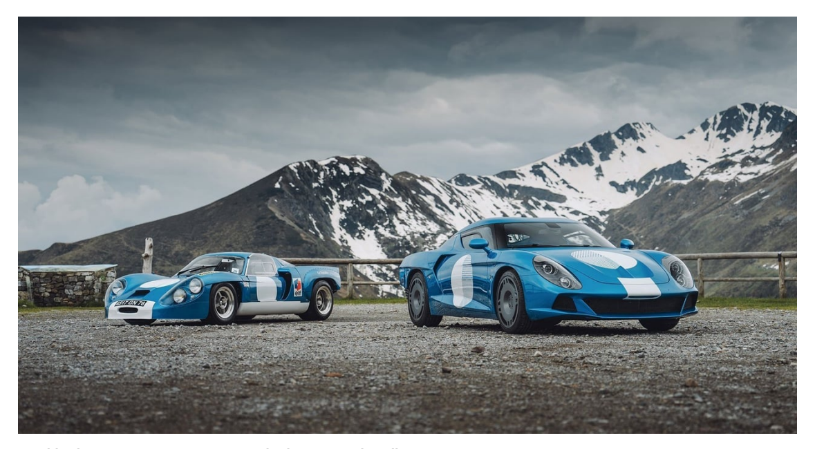
We ride shotgun over Passo San Marco in the AGTZ Twin Tail prototype % \left\{ \mathbf{r}_{\mathbf{r}}^{\mathbf{r}}\right\} =\mathbf{r}_{\mathbf{r}}^{\mathbf{r}}

It's one of the hottest cars of the year. After the AGTZ Twin Tail was launched at FuoriConcorso, we hopped in the passenger seat for a first test drive on Alpine roads.