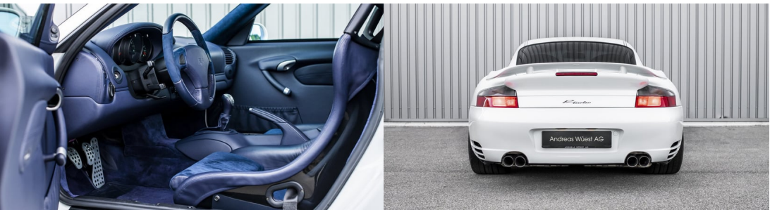
Blue Suede Seats