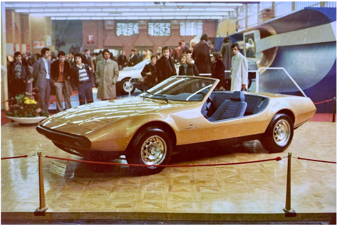
During three months of design and manufacturing, Carrozzeria Michelotti created extravagant one-off two-seater without a roof or doors, but plenty of style. Originally the Felber Ferrari Beach Car had been ordered in Light Metallic Blu with a blue denim interior, but the impact of the oil crisis on Qatar meant that Sheikh Al Thani had to cancel his extravagant order – and Michelotti chose to paint the car in Bronze Metallic and show it at the Geneva Motor Show in March 1976. In the years to come, the beach car changed hands multiple times, drawing crowds at Swiss lakeside boulevards and earning the nickname ‘Croisette’.