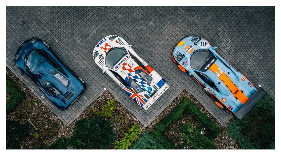
Furthermore, Classic Driver and Kiklo Spaces have joined forces with George Bamford of Bamford Watch Department to create a limited-edition, retro-futuristic wristwatch commemorating the unique event. The Bamford B347 'Uncovered at Thirty' automatic monopusher chronograph features a carbon-style dial with sub-dials reminiscent of the McLaren F1's iconic instrument panel, a gold monopusher inspired by the famous exhaust cover, and a titanium case with custom engraving. Only five pieces will be made and are for sale exclusively for guests at the 'Uncovered at Thirty' event.