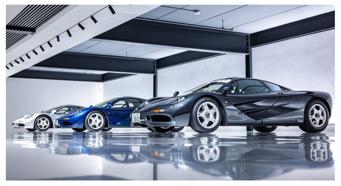
On the 13th September 2022, Classic Driver and Kiklo Spaces have assembled over a dozen McLaren F1s and a small number of high-profile guests for their 'Uncovered at Thirty' private anniversary event. Taking place at Kiklo Spaces, a new space for car culture in Hampshire, United Kingdom, the line-up of McLaren F1s includes some of the most remarkable road cars, as well as a stunning selection of iconic, short- and long-tailed GTR race cars. There is, for instance, chassis 043, one of the most original F1 road cars in existence, in a unique colour that matches the livery of chassis 01R, the overall winner of the 24hrs of LeMans in 1995. Chassis 02R, the most prolific winner of all F1 race cars will also be on display, as will be chassis 19R, the very first of the "long tail" F1 GTR race cars from 1997.