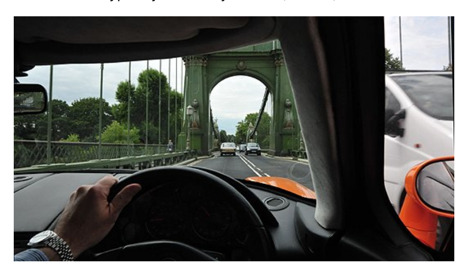
The Bristol Fighter

It was a clearly a case of 'old meets new' and the partnership will be an interesting one. Frazer-Nash is not simply collecting brands; the future could well see the effortless torque of all-electric, or hybrid powertrains available in a typically Bristol styled and (British-) built four-seater.