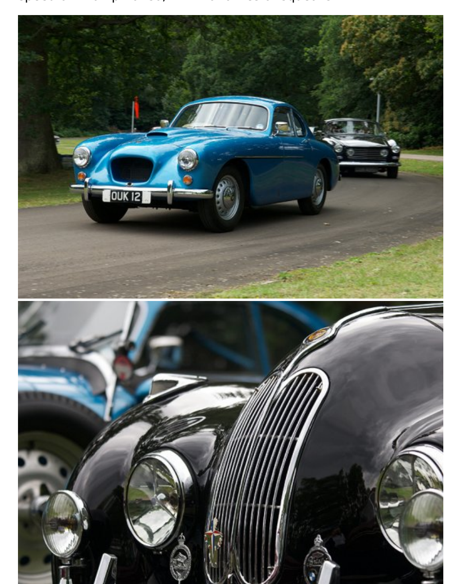
All of that, plus ditching the parts bin of 1970s switches and dials, will give the marque a bright future.

In recent years, 'no one has made cars like Bristol'. Its future under Frazer-Nash ownership will give that expression a positive, rather than negative connotation.