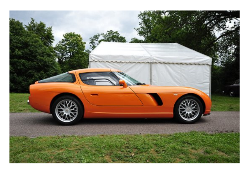
No, Frazer-Nash, keep the quirky Bristol Cars DNA, maintain the superb interior ergonomics, clothe your new car in at least girl-next-door styling, and use a powertrain that's economical and effortless up to a maximum speed of 120mph or so, with no rattles or squeaks.