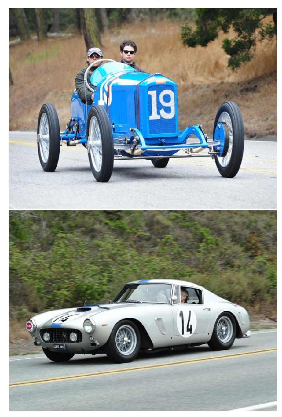
Next year's Pebble Beach Concours d'Elegance is scheduled for Sunday August 21 2011 , with Mercedes-Benz and 125 Years of the Automobile , the Stutz Centennial , Italian Motorcycles and the Ferrari 250 GTO as some of the official themes.

If anything, you can appreciate these cars all the more when they are moving and, bar a $9.50 ticket for the (optional) trip along 17-Mile Drive , you can sit by the side of the road, taking it all in without spending a dime. A great event and one of the highlights of the week.