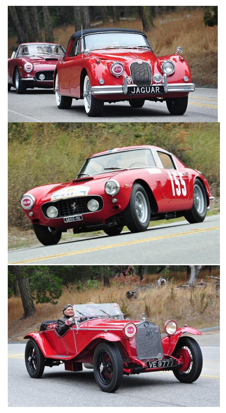
Text: <u>Steve Wakefield</u>

You can read the review of the <u>The 2010 Pebble Beach Concours d'Elegance</u> and the <u>Gooding &</u> <u>Company official Pebble Beach auction</u> elsewhere on Classic Driver.