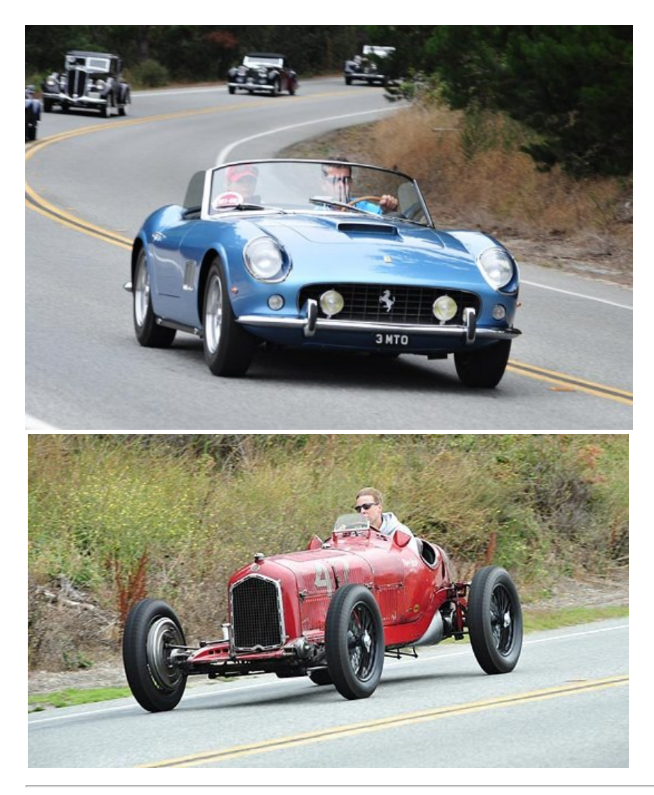
ClassicInside - The Classic Driver Newsletter <u>Free Subscription!</u> Gallery